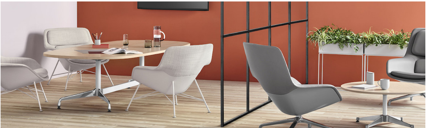
table have to crane their necks around the person in front of them in order to be able to see the faces of the people in the monitor. Fortunately, new thinking in conference table design has led to designs which are adaptable to both. In particular the nutcracker configuration is a good choice for organizations needing to provide for both conferencing and video conferencing.