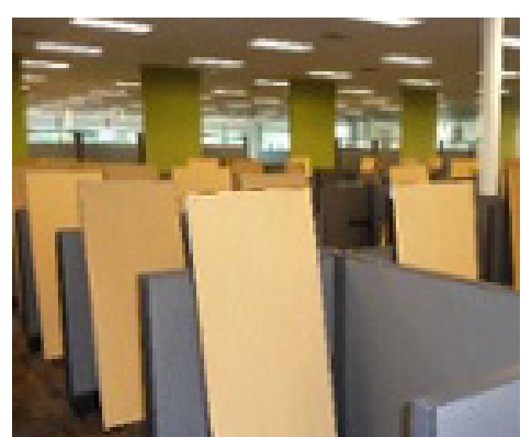
Delivery & Installation - Services Page of 2